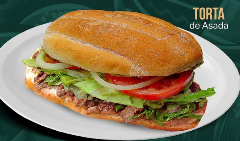
TORTA de Asada