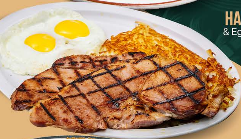
HAM & Eggs