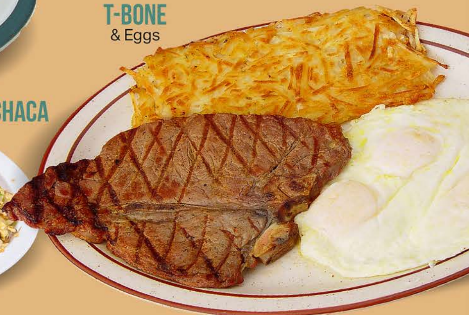
T-BONE & Eggs

WARNING: Eating eggs or meat may cause severe illness and even death in persons who have liver disease (E.G. Cancer or others chronic illness that weakens the immune system). AVISO IMPORTANTE: El comer huevos o carnes crudas pueden causar una enfermedad grave y hasta la muerte. En las personas que padecen de enfermedades del hígado (Por ejemplo cancer u otras enfermedades cronicas que debilitan el sistema inmunologico).