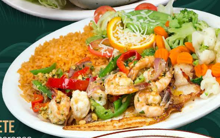
FILETE con Camarones