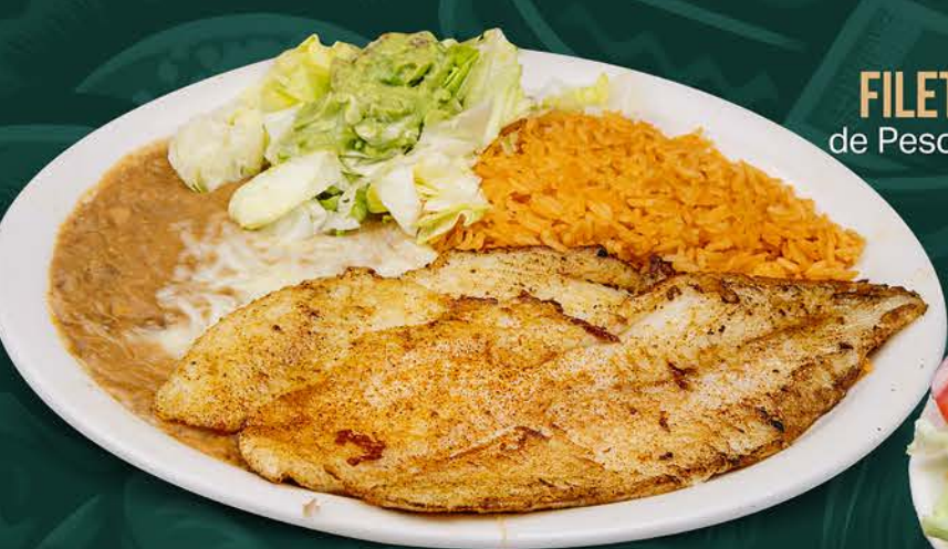
FILETE de Pescado