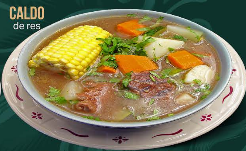
CALDO de res