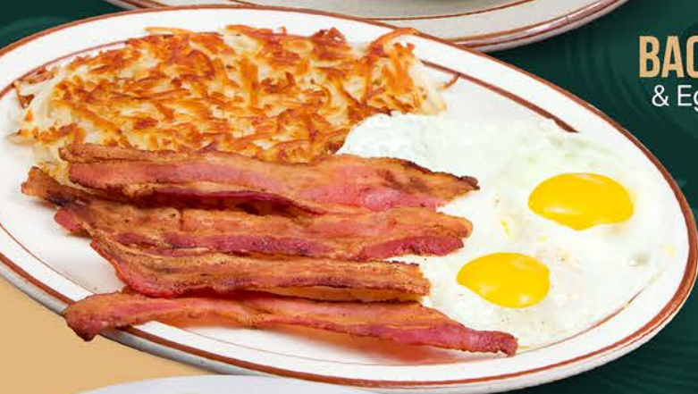
BACON & Eggs