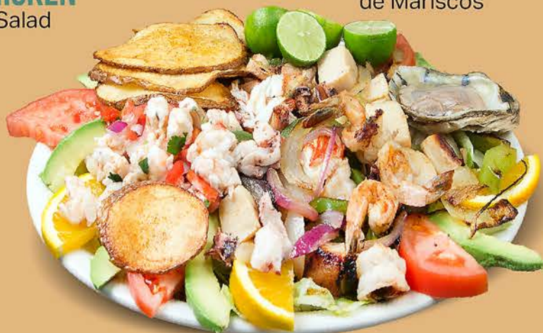
ENSALADA de Mariscos