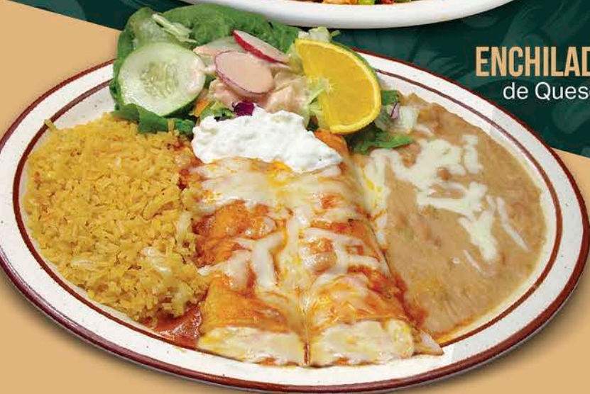
ENCHILADAS de Queso