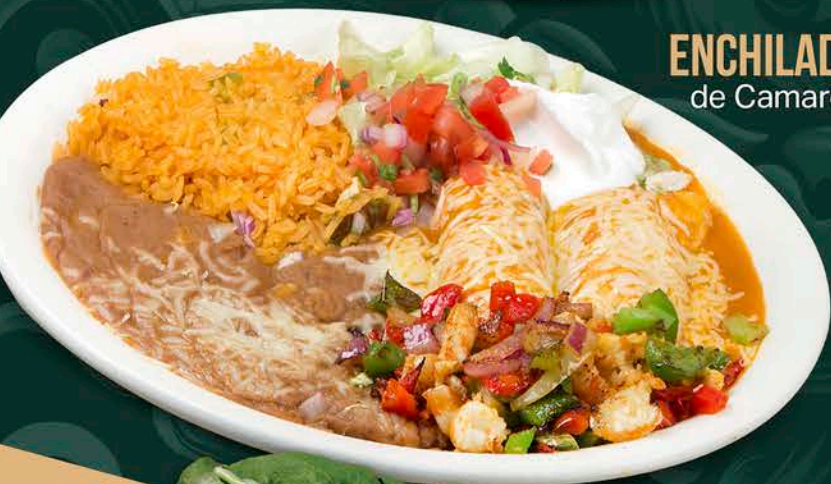
ENCHILADAS de Camaron