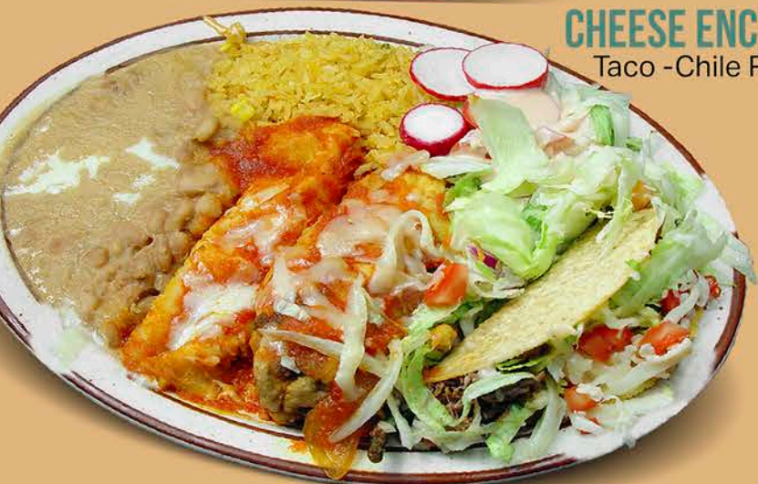
CHEESE ENCHILADA Taco -Chile Relleno