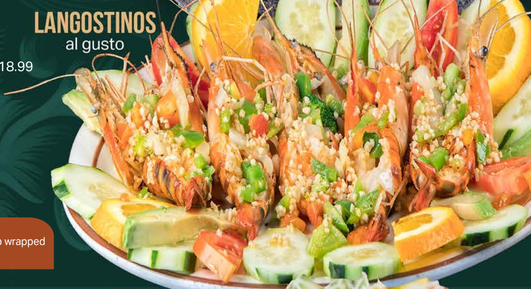
LANGOSTINOS al gusto